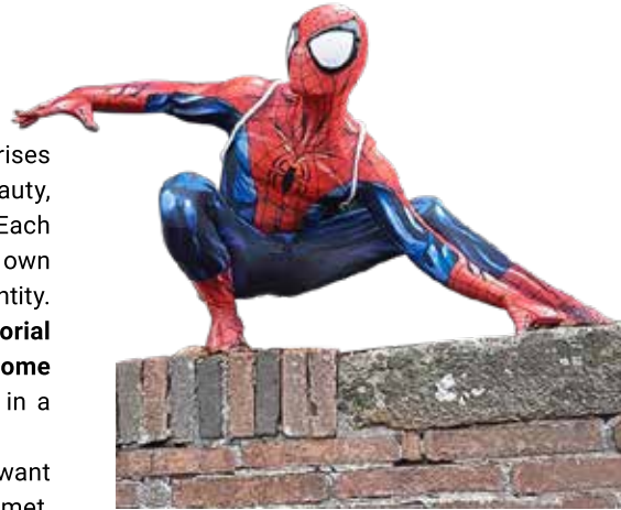
Lucca Comics & Games

the most important European Comic festival: Lucca Comics & Games.