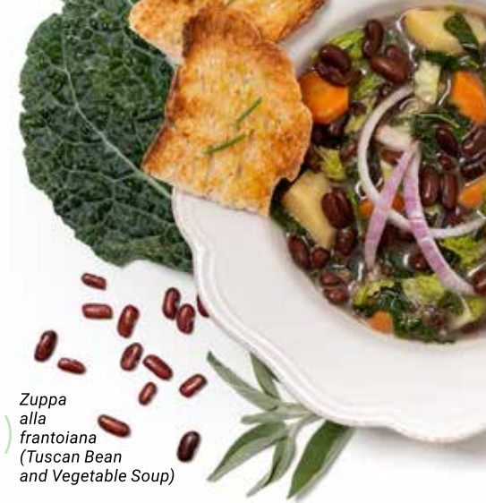
Zuppa alla frantoiana (Tuscan Bean and Vegetable Soup)

Festa del Pane (Bread festival) to the Cantine Aperte (Open Wineries) and the oil mills which open to the public to reveal the secrets of wine and oil production.