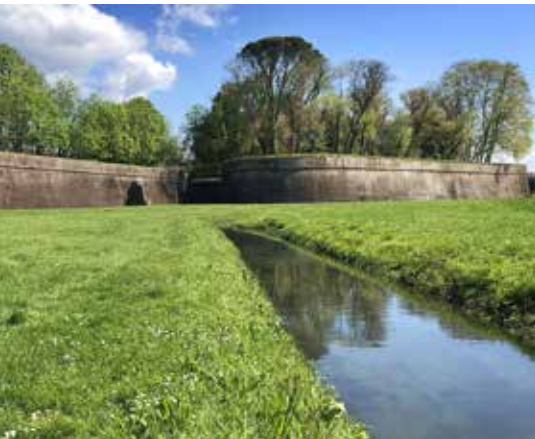
City Walls, Lucca

Remember to keep an eye on the calendar for the year-long sparkling events programme. From those dedicated to one of the symbols of the territory, Giacomo Puccini, to the modern Lucca Summer Festival without forgetting