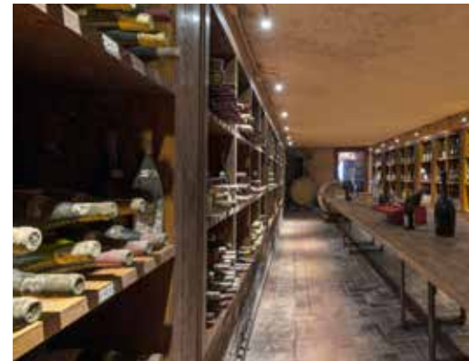
Winery on the Wine and Olive Oil Trail

Many opportunities are offered to experience the essence of these magical places. From Settembre Lucchese (A month-long multi-faceted event), to the exhibition of the Antiche Camelie (Flower and Plant Show) to Il Desco (Food and Wine festival), passing through the