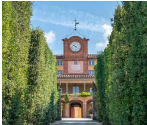
Villa Reale, Marlia

Artistic heritage that is History, but even more, stories.